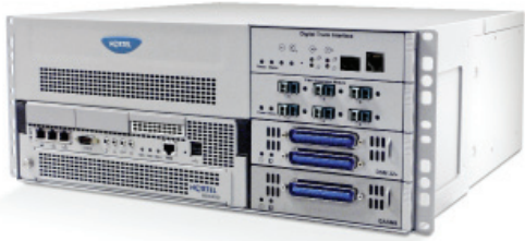
Avaya Business Communications Manager 450